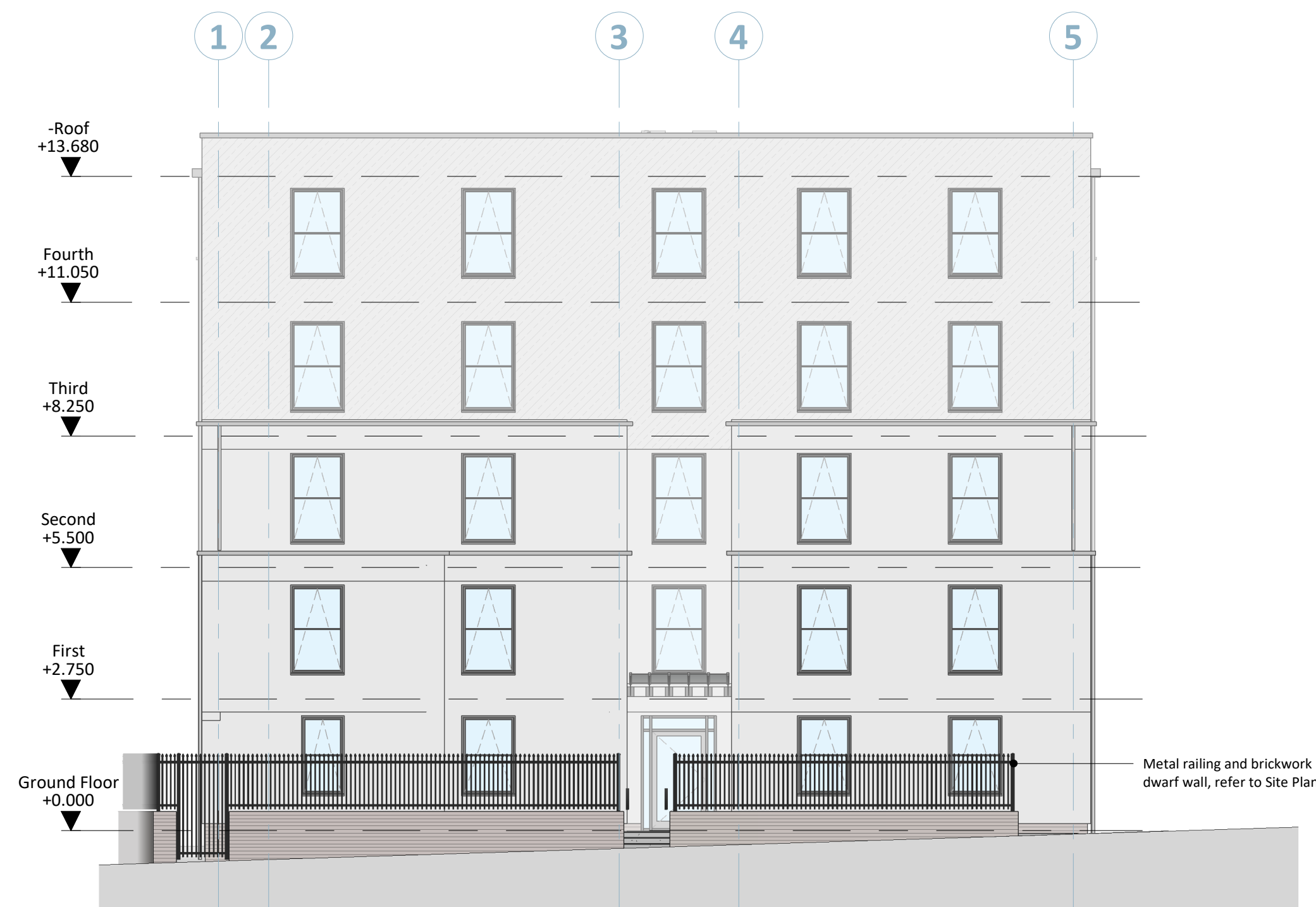
3. Front Elevation (South). From Road SCALE - 1 : 100@A1