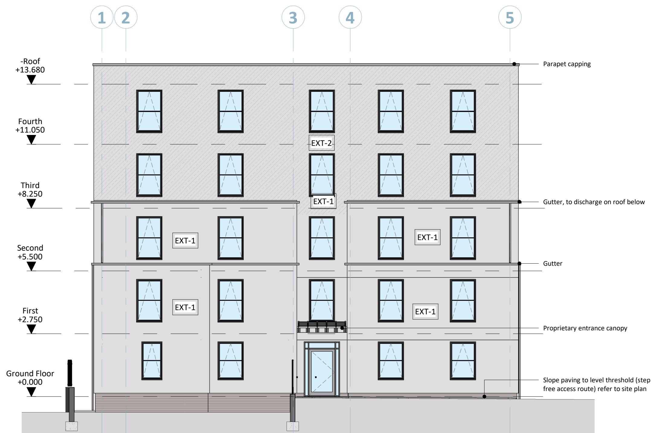
5. Front Elevation (South) SCALE - 1 : 100@A1