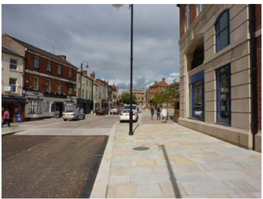
Town Centre Improvements