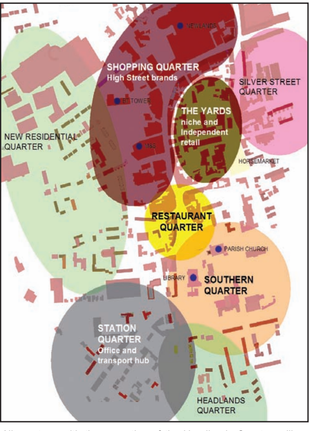
All quarters, with the exception of the Headlands Quarter, will contain an element of retail development.

Also the Draft Urban Codes SPD which identifies the architectural and spatial characteristics of each quarter and will have a bearing on the scale and proportions of the shopfront.