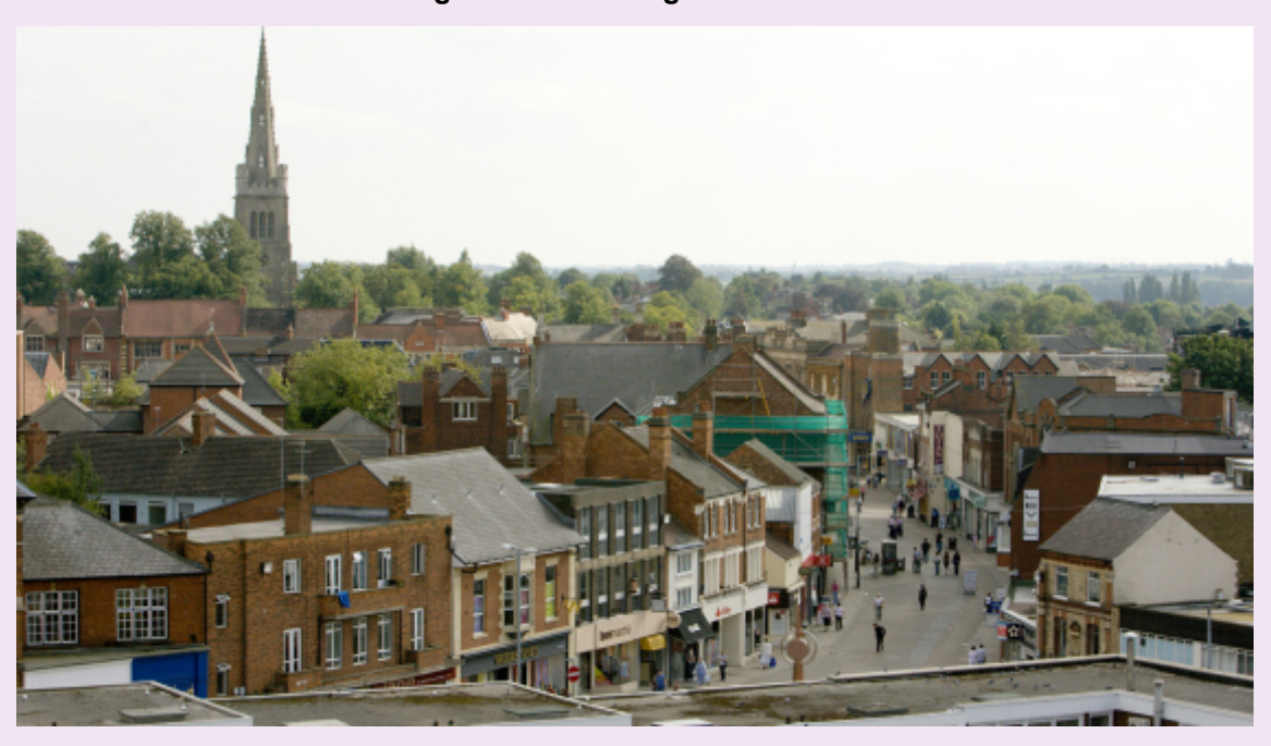
Figure 1.7 Kettering Town Centre

Quarter and the 16,000m<sup>2</sup> development of the Wadcroft shopping centre for new retail, Kettering offers ongoing investment opportunities.