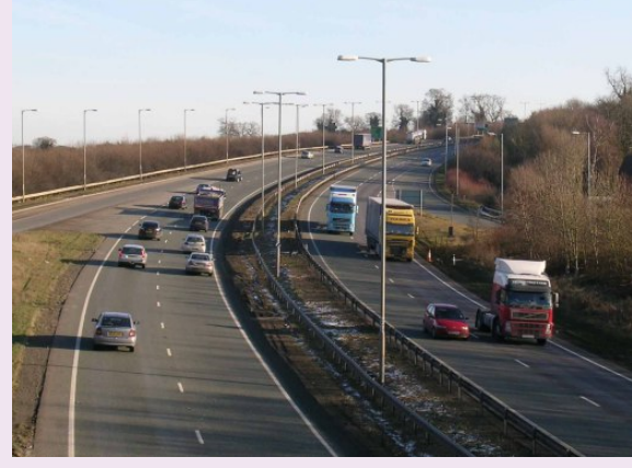
Figure 1.5 Good Transport Links - Kettering A14

Centre is home to the National Volleyball Centre which is the base for the indoor volleyball team's training camp and competition. Beyond the town centre, the area has a wealth of countryside, natural heritage and woodland areas waiting to be explored.