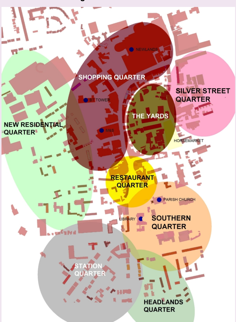
Figure 1.1 The Quarters