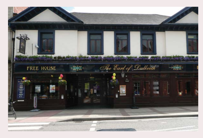
Here a historic building has been reinvigorated by sensitive repairs that do not detract from its overall character

reflect this. In these areas there is more scope for modern finishes and materials provided they are used in an innovative and original way.