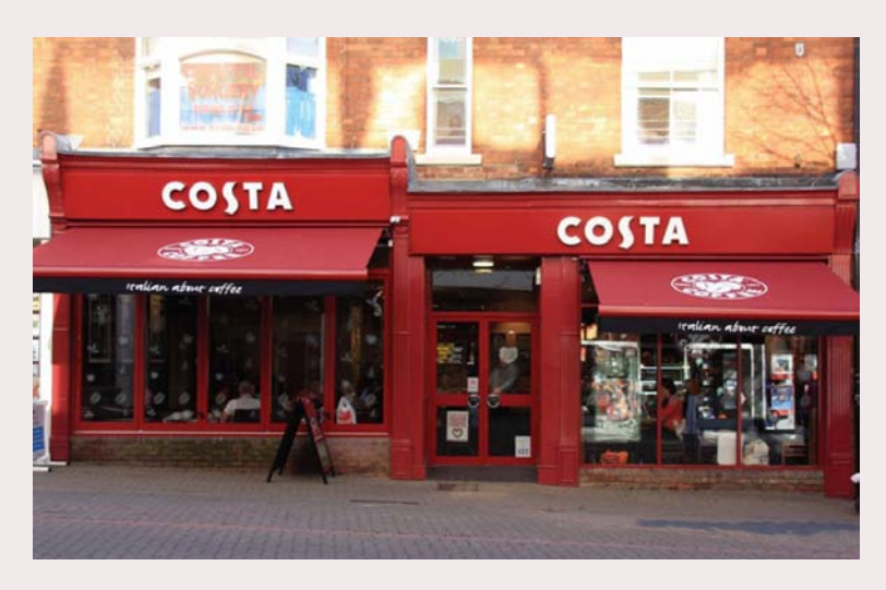
Note the use here of a traditional retractable roller awning which does not obscure architectural detailing