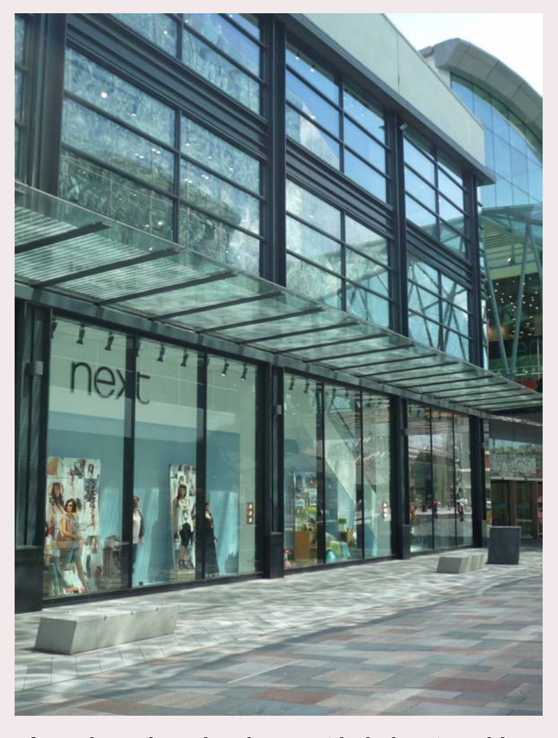
A modern shop development in Leicester with a glass canopy. Note the minimal use of signage to create an attractive unit