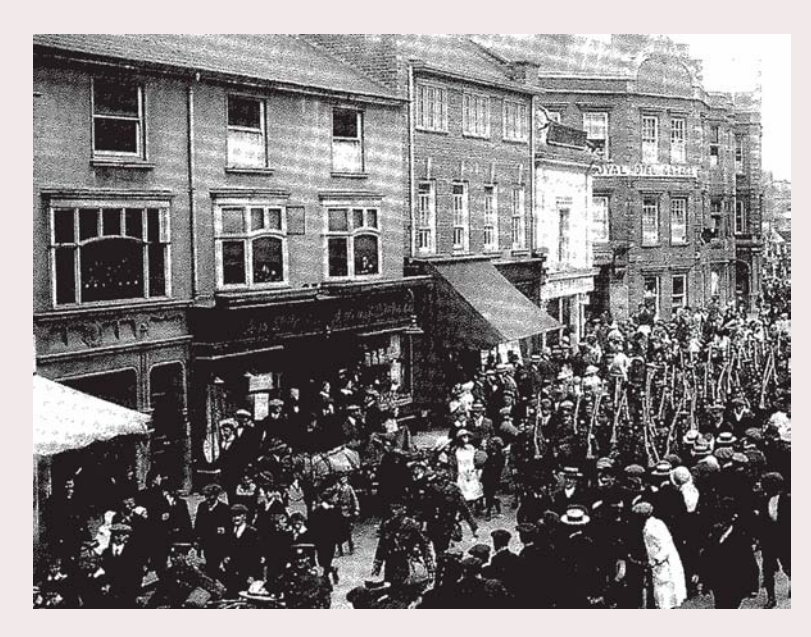
An image of Market Place from the early twentieth century