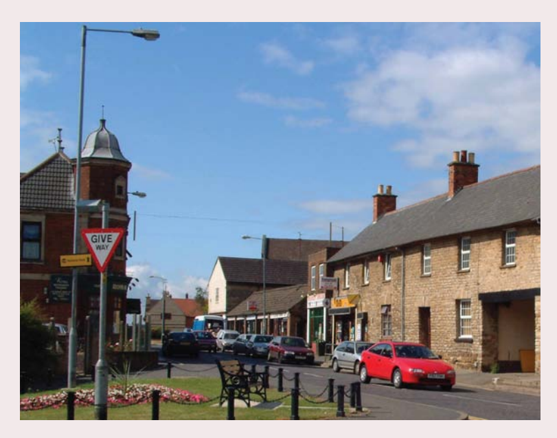
Burton Latimer High Street

4.3 In recent years retailers have moved up the High Street towards the north leaving an unequal spread of shops to the mid and southern end. The character of the western side of the central High Street area has also changed, where it was once an 18th century farmhouse (Denton's Farm) it is now the Churchill Way retail development. The loss of the farmhouse is a result of the change from rural economy to major housing development with a supporting retail focus.