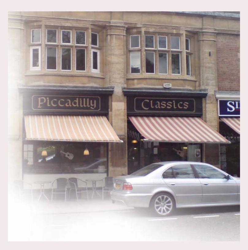
Piccadilly Buildings in Kettering: an example of a row of traditional shops with well-designed and appropriate signage

In terms of traditional shopfronts, these or any other remaining features should be retained and repaired. It is often cheaper to repair an existing shopfront than to replace it. In a number of instances a traditional shopfront may have been covered by inappropriate frontage, if this is the case then the original shopfront should be restored to it's former glory.