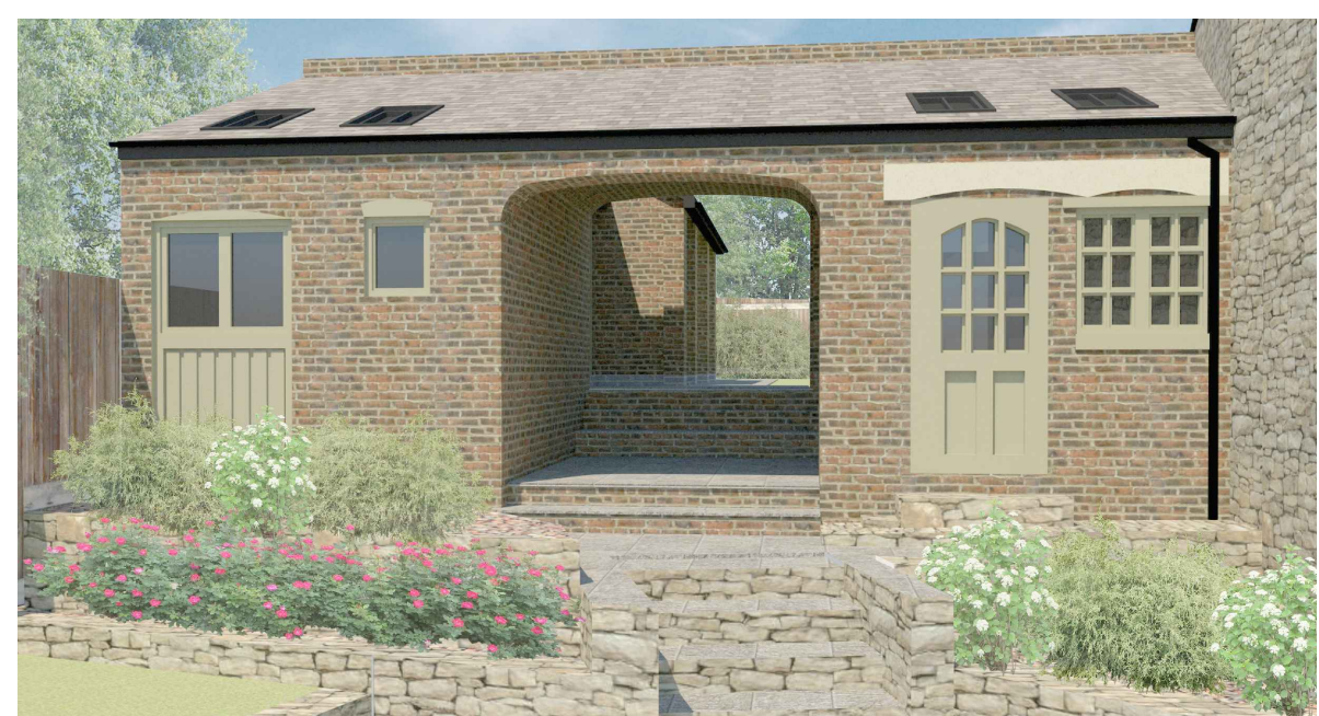
Proposed: Visuals not to scale - for illustrative purposes only