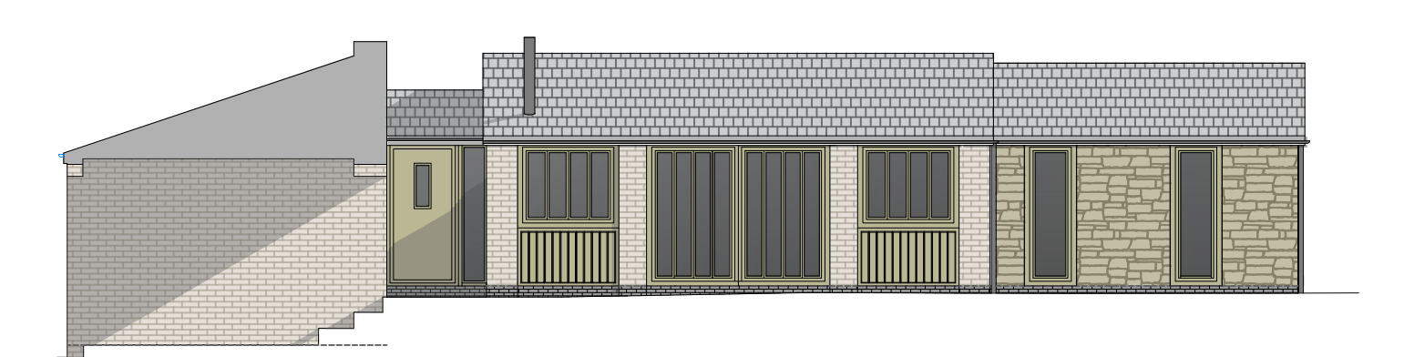
Proposed: Elevation C scale 1:100