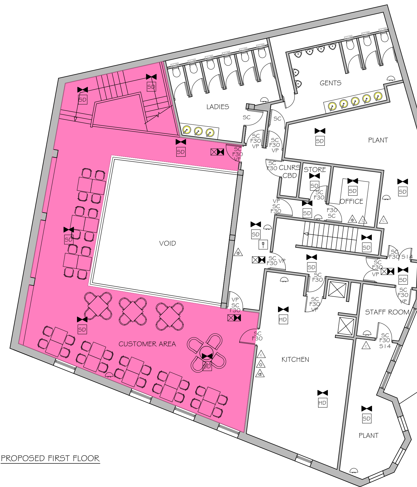
PROPOSED FIRST FLOOR

ALL WALLS AND PARTITIONS TO BE MINIMUM HALF HOUR FIRE RESISTANCE. EMERGENCY LIGHTING TO COMPLY WITH 2005 EDITION OF BS 5266 PART 1. FIRE SAFETY RELATED SIGNS AND NOTICES TO COMPLY WITH THE HEALTH AND SAFETY (SAFETY SIGN AND SIGNAL) REGULATIONS 2005. FIRE ALARM AND DETECTION SYSTEM TO BE INSTALLED TO BS 5839 PART 1 2002 FIRE FIGHTING EQUIPMENT TO COMPLY WITH BS 5306 WALL AND CEILING LININGS ARE TO BE CLASS 1 SURFACE SPREAD OF FLAME (AS DEFINED BY BS 476 PART 7) IN PUBLIC AREAS AND CLASS 0 IN ESCAPE ROUTES. UPHOLSTERED SEAT FURNITURE TO SATISFY THE FOLLOWING • IGNITION SOURCE (CIGARETTE TEST) AS SPECIFIED IN BS 5852 PART 1 • FIRE TEST FOR FURNITURE METHODS OF TEST FOR THE IGNITABILITY BY SMOKERS. • BS 5852 PART 2 FIRE TEST FOR FURNITURE - METHODS OF TEST FOR THE IGNITABILITY OF UPHOLSTERED COMPOSITES FOR TESTING BY FLAMING SOURCE, MINIMUM TEST TO BE CRIB IGNITION SOURCE 5. FABRICS THAT HAVE HAD A FLAME RETARDANT TREATMENT TO PASS THE WATER SOAK TEST AS DEFINED BY BS 5651 TEST CERTIFICATE TO BE SUBMITTED TO FIRE AUTHORITY. CURTAINS AND DRDAPES TO SATISFY TYPE B PERFORMANCE REQUIREMENTS TO BS 5867 PART 2. ARTIFICIAL FOLIAGE AND DECORATIVE EFFECTS TO BE FIRE RETARDANT TO THE SATISFACTION OF THE FIRE AUTHORITY.