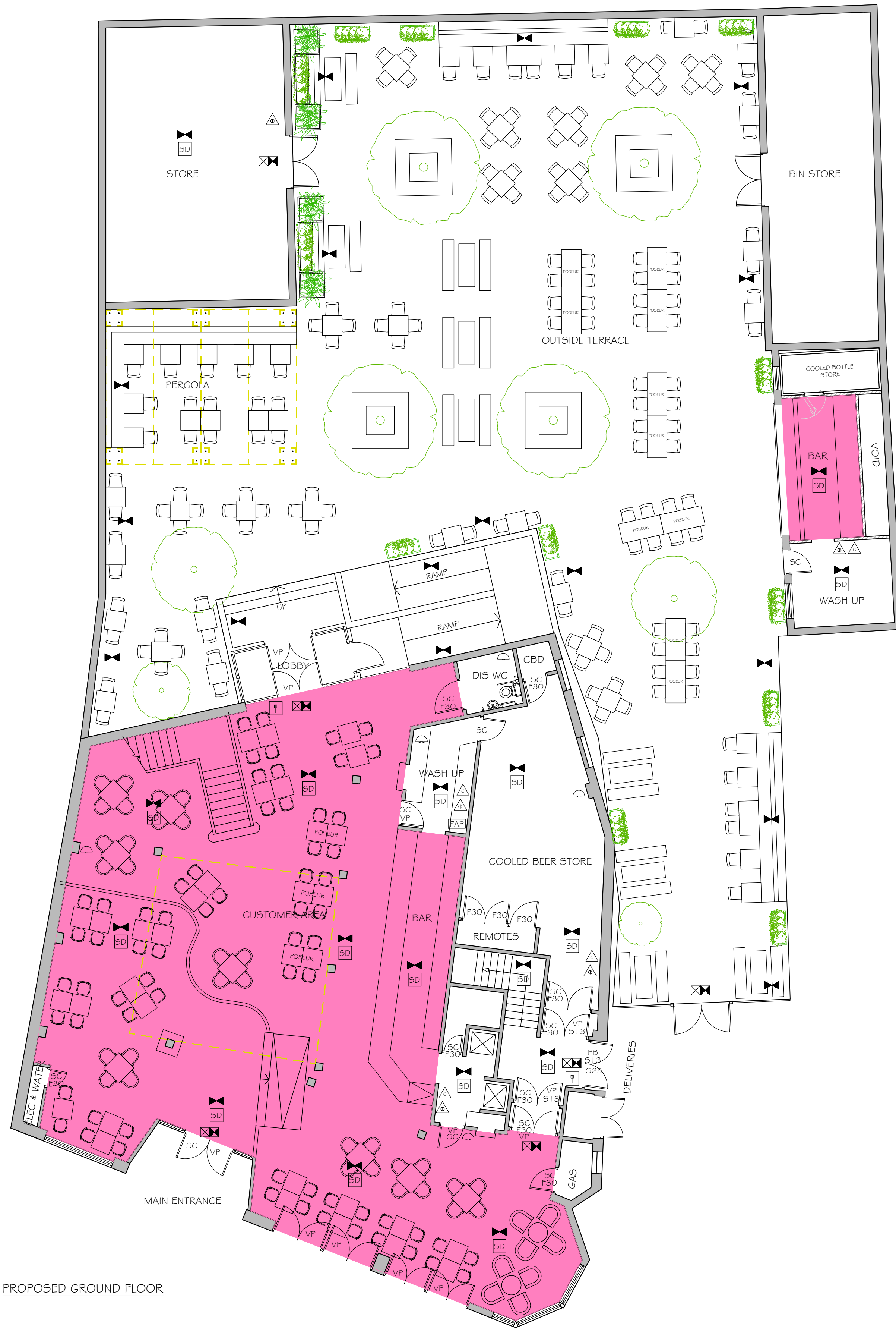
PROPOSED GROUND FLOOR